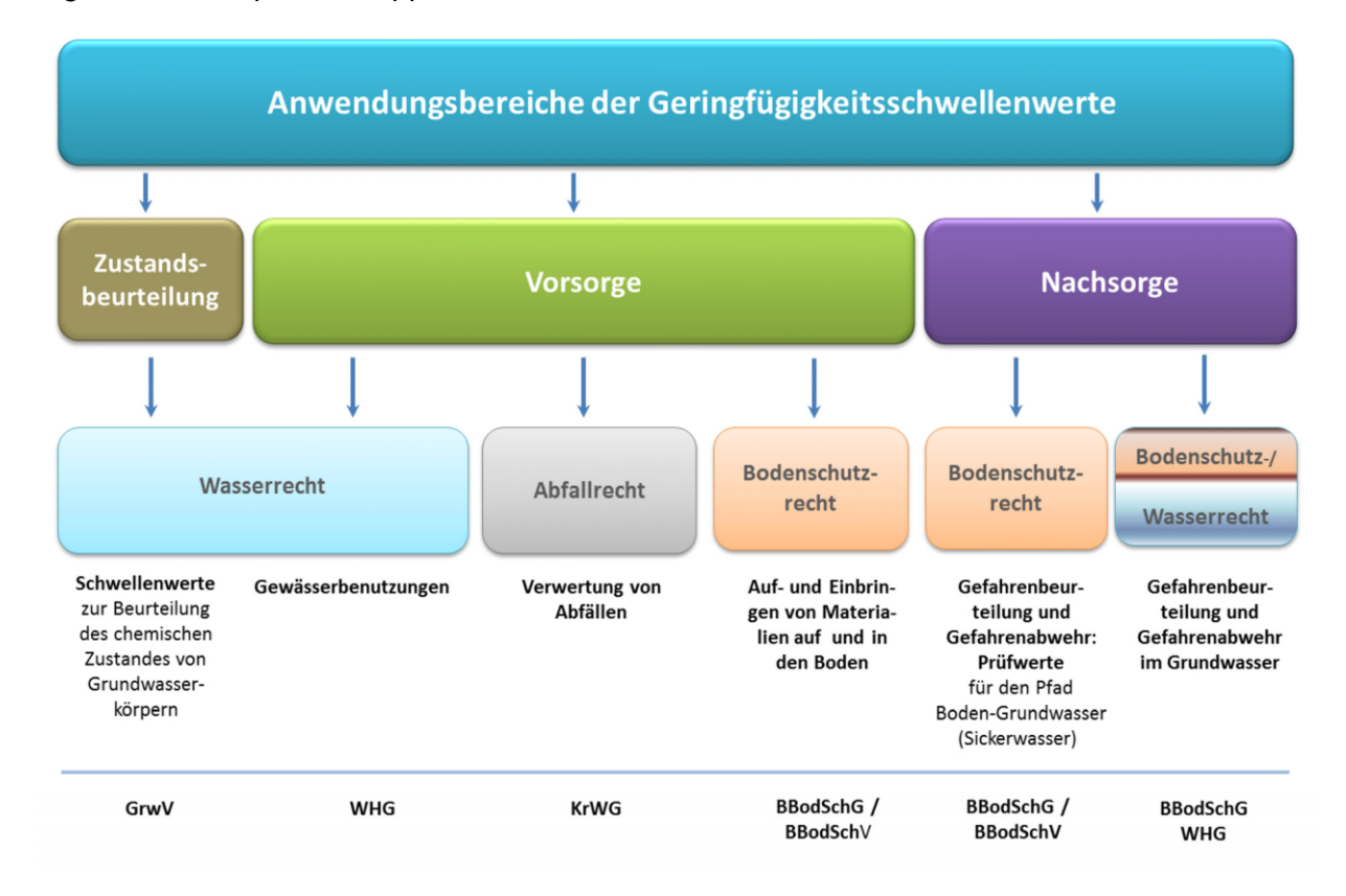
Fig. 1: Applications of the insignificant threshold values

Figure 1 shows possible applications of the GFS values.